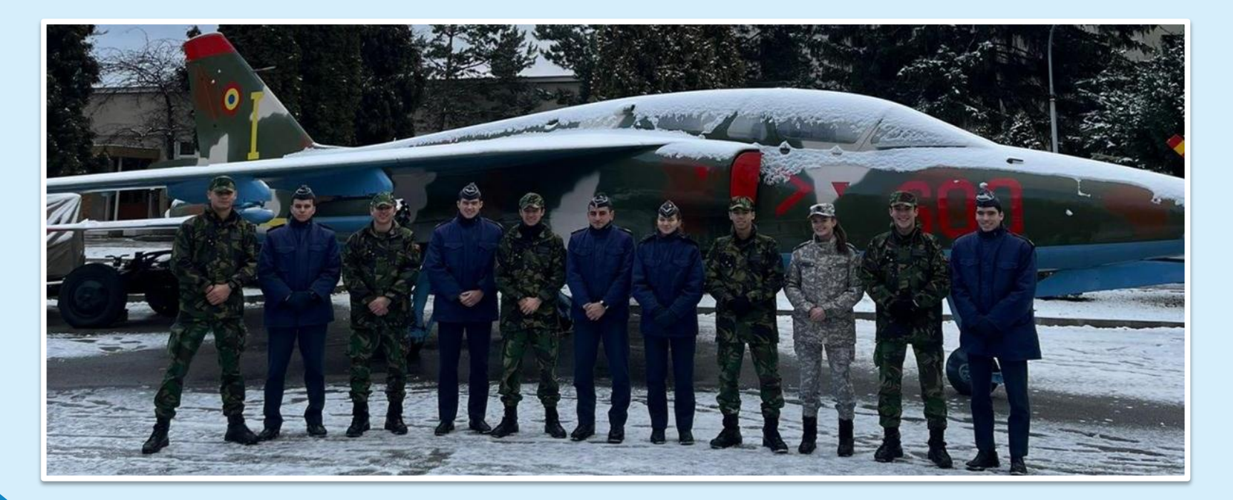
BULGARIAN AIR FORCE ACADEMY:1 CADET